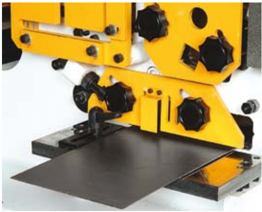
Flat Bar Shearing Station