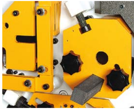
Bar Shearing Station