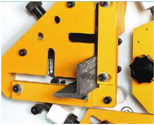
Angle Shearing Station